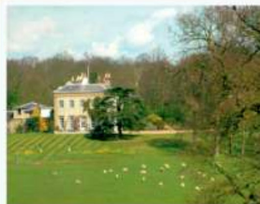
Riffhams, Danbury, Essex CM3 4DS