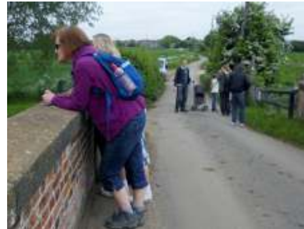
The Bridge near Sandford Mill.

Anyone in the village and beyond was invited by web site, A4 local ads etc so it was disappointing not to see a few more 'new faces' in the 30 or so of us who started on the dot of 10 a.m. from St. Andrew's car park. By the time we had got to the end of Brick Kiln Road we were spread out over hundreds of yards as the leaders were anxious to press ahead.