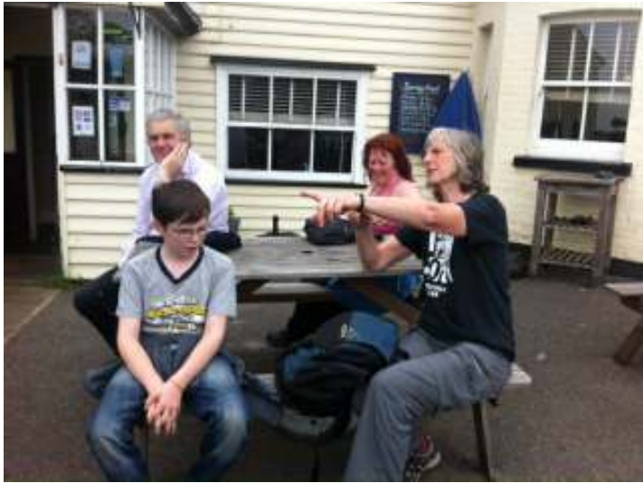
At the Cricketers!

There we were joined by some ‘second half’ walkers and ‘non-walkers-but -sponsors’, so much so that we filled the restaurant room and took the outside tables as well with about 42 of us all told.