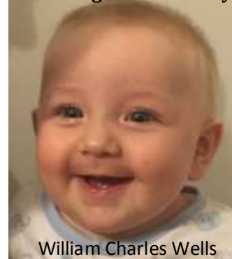
William Charles Wells