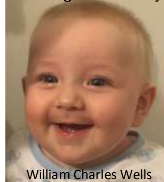
William Charles Wells