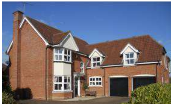
The Rectory at Sandon

This post needs an energetic priest with the ability to build on the traditions of the past and to guide our development into the future and to work with neighbouring parishes to determine the medium and long-term future ministry for Sandon; as it is expected that this will be a one-off appointment.