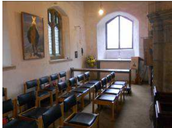
The Lady Chapel

aumbry, a thurible has just been purchased, liturgical colours are observed and a bell is tolled for communion. We have experimented with Morning Prayer but this has not proved popular. We would like our reputation to be one of being tolerant and accommodating, more middle of the road and willing to experience different ways of knowing God.