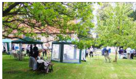
Barbecue in the churchyard

Street Pastors (2 members serve in Chelmsford) Tools with a mission (collecting tools for developing countries) History Society Concerts Samaritans – supported by some church members