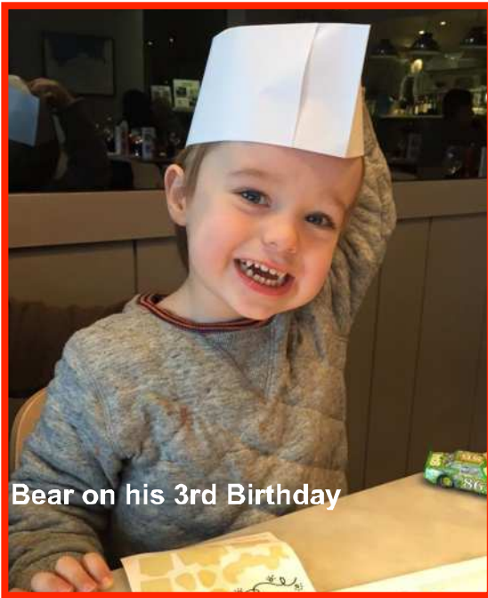
Bear on his 3rd Birthday