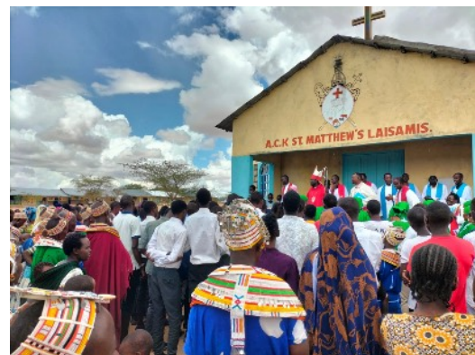
Consecration of St Matthew's Laisamis

Our Laisamis church compound also has a primary school, funded by Compassion.