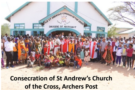
Consecration of St Andrew's Church of the Cross, Archers Post