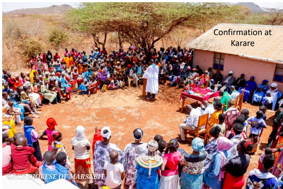
Confirmation at Karare