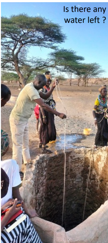
Is there any water left ?