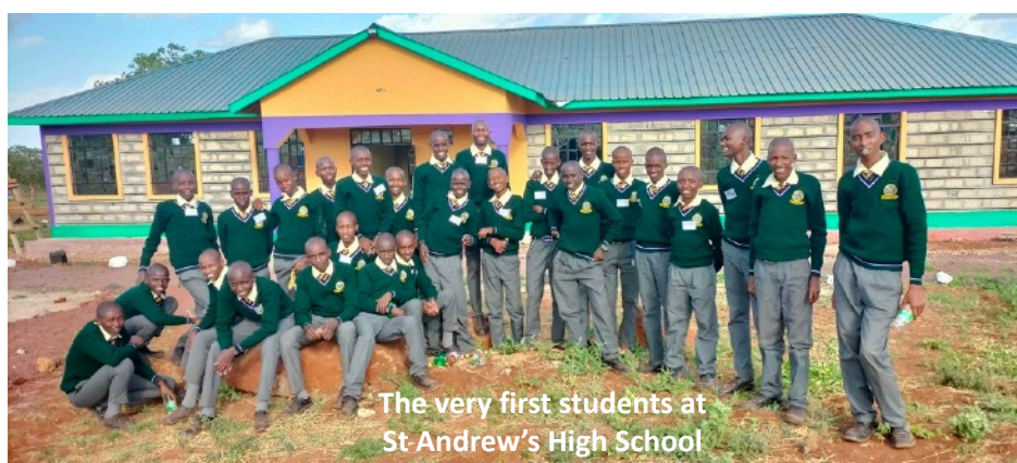
The very first students at St Andrew's High School

Another cause for huge joy is the opening of the new St. Andrews High School for Boys. The school actually opened on May 9 th with 27 boys, but the formal opening was on July 17 th . That was at the newly consecrated church at Badassa, Church of the Good Shepherd. It was attended by representatives from USA, whose charity, KCEP, has funded an amazing primary