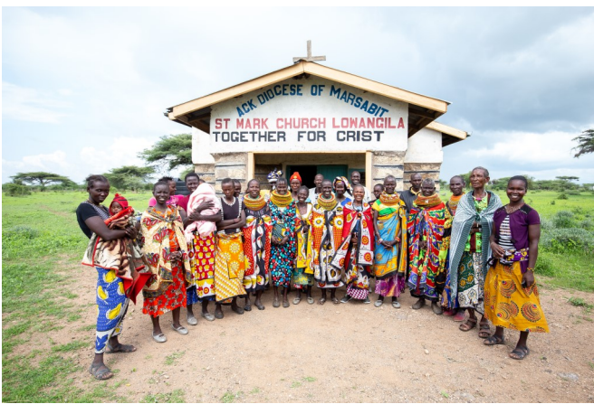
Lowangila Mothers' Union