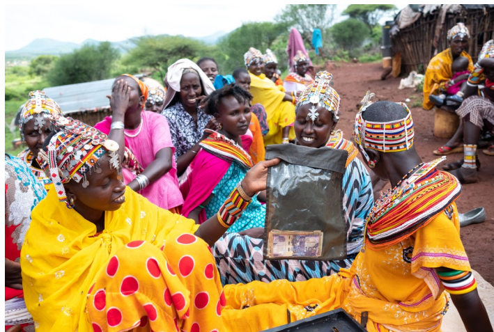
Women from Karare church showing their savings as they gather for a meeting of their microfinance group. They will be supported by Five Talents UK to develop their businesses further in the coming year.