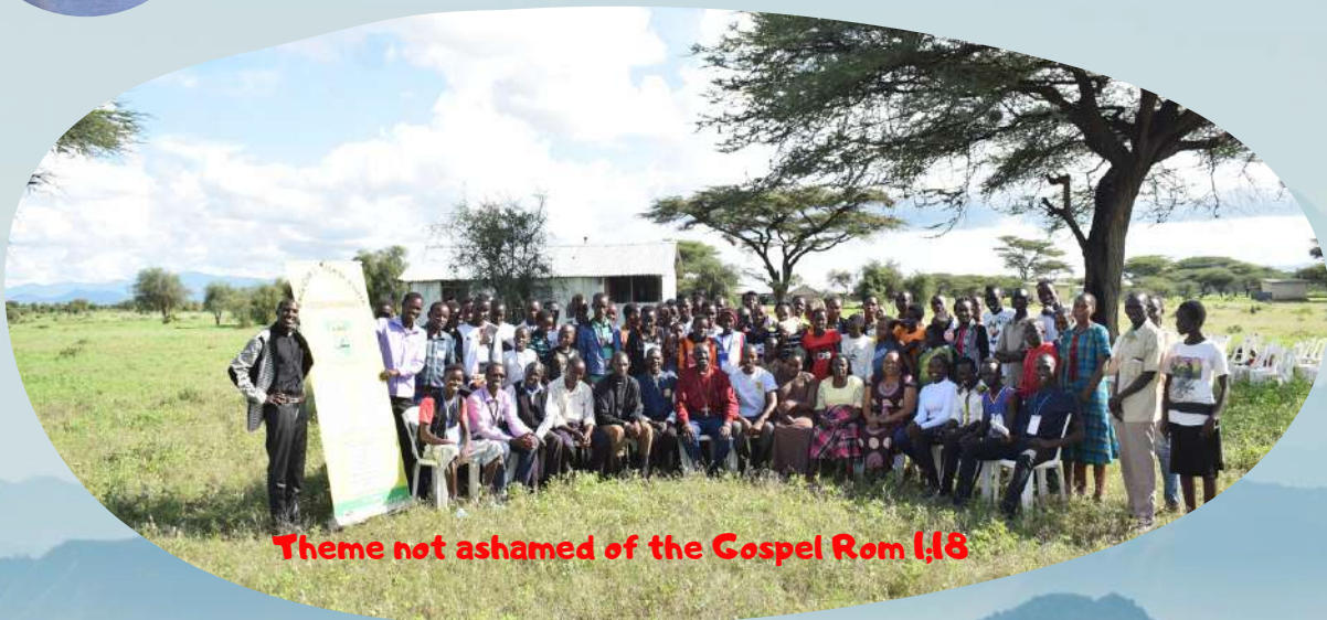
Theme not ashamed of the Gospel Rom 1:16