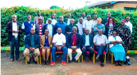
Bishop, Clergy and Diocesan staff January 2021