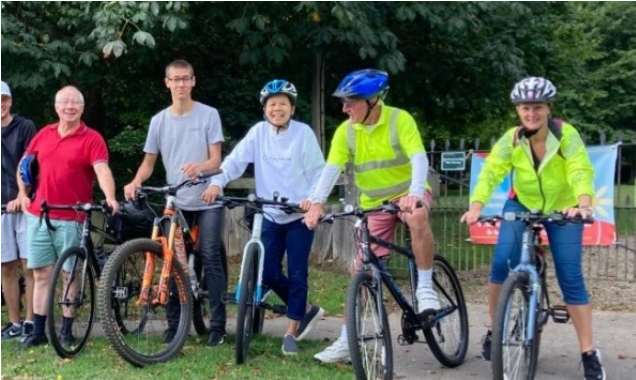
Annual bike ride