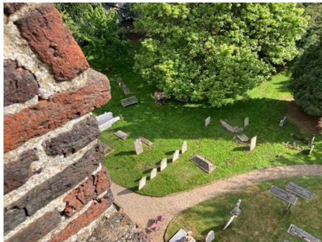
View from the church tower