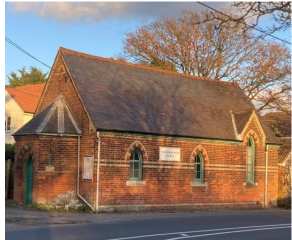
Howe Green Chapel