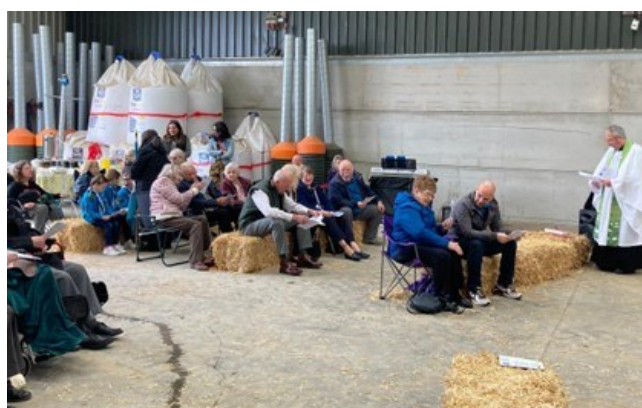
Rogation service at Cherries Barn