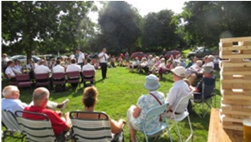
Tea on the Green