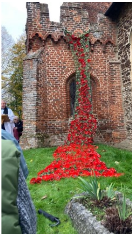
Poppies for Remembrance Sunday

Historically significant Grade 2b listed building and attractive church at the centre of the village of Sandon