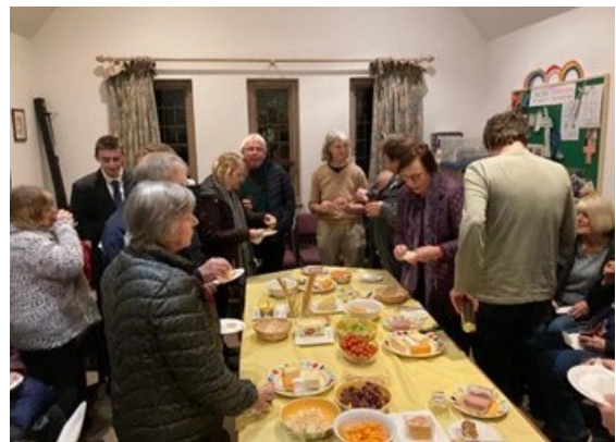
St Andrew's cheese and wine