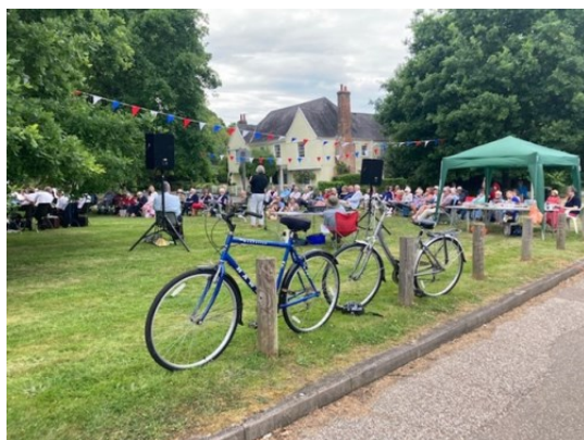
Village Green Jubilee event