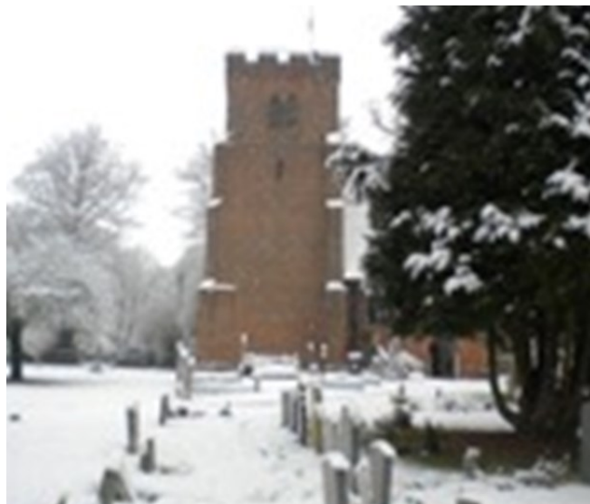
Sandon Church in the winter