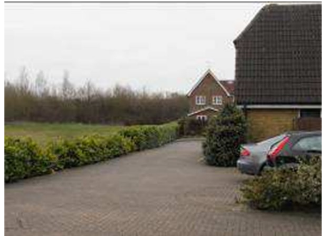
View from the front door