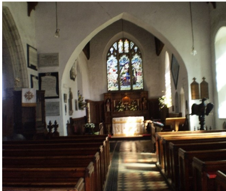
Inside the church