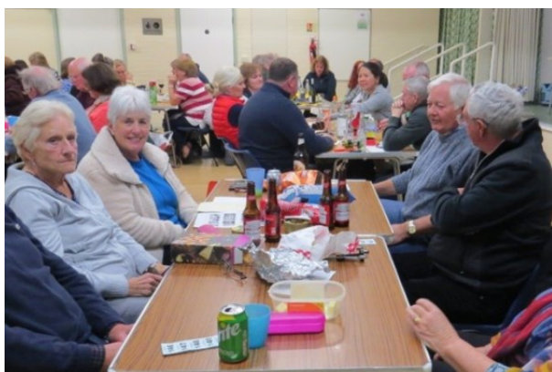
Quiz in the Village Hall