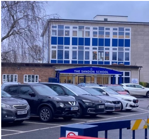
The Sandon School