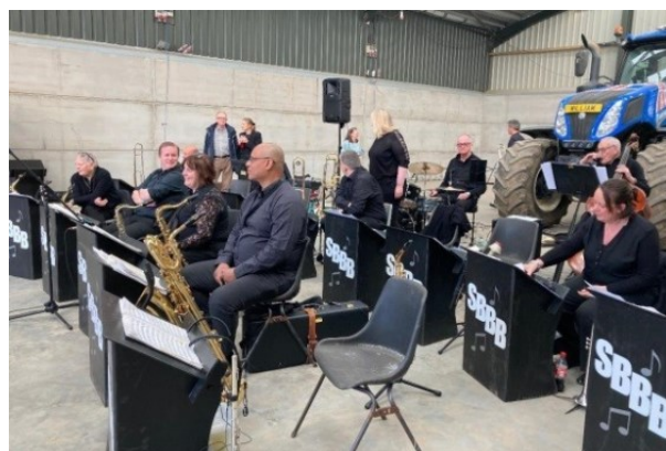
Big Band evening