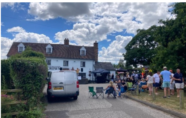
The Crown, local public house