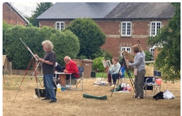
Artists on the Green