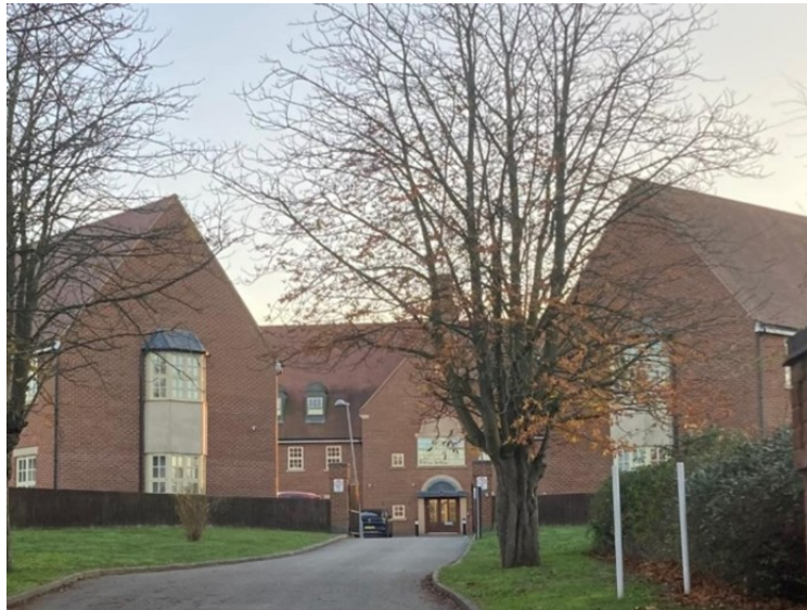
Chelmsford Care Home