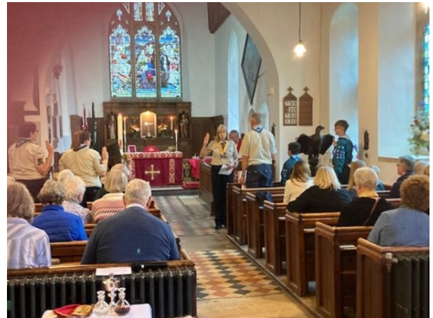
Scouts at a service