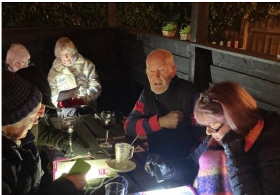
Beer and carols