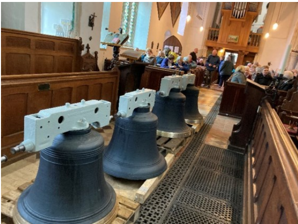
Bells during refurbishment